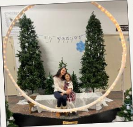
Snowball Event Friday January 31st