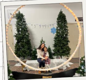
Snowball Event Friday January 31st